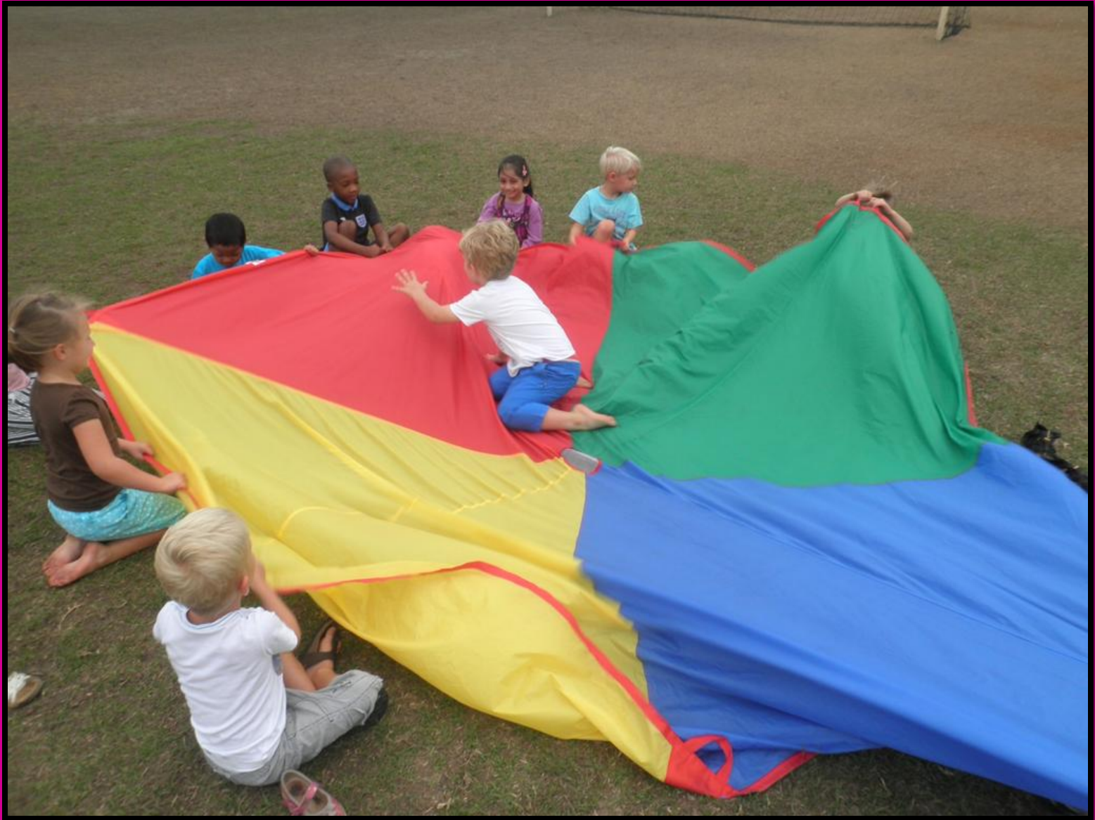
Sharks and fishermen.