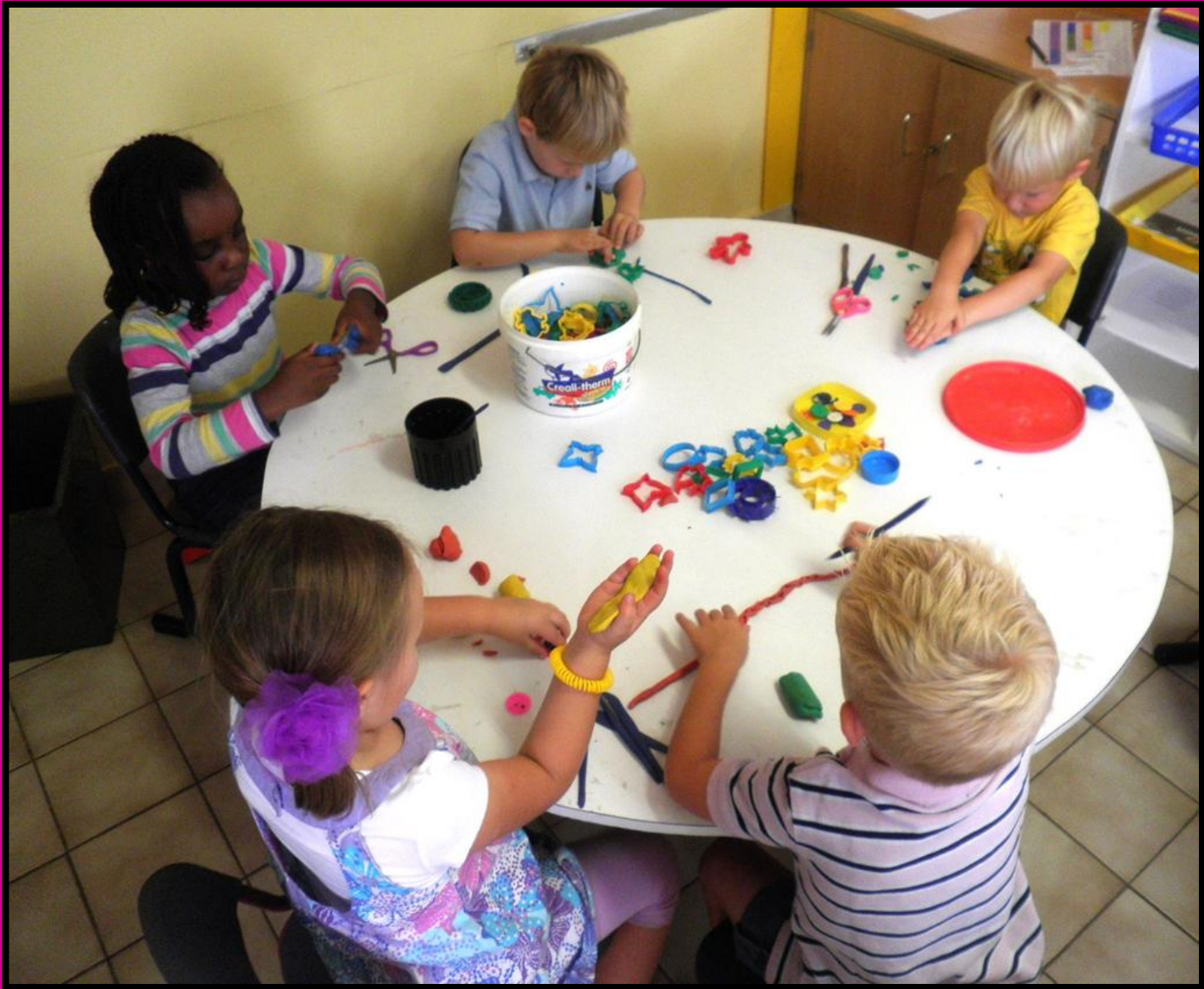
They found the playdough.