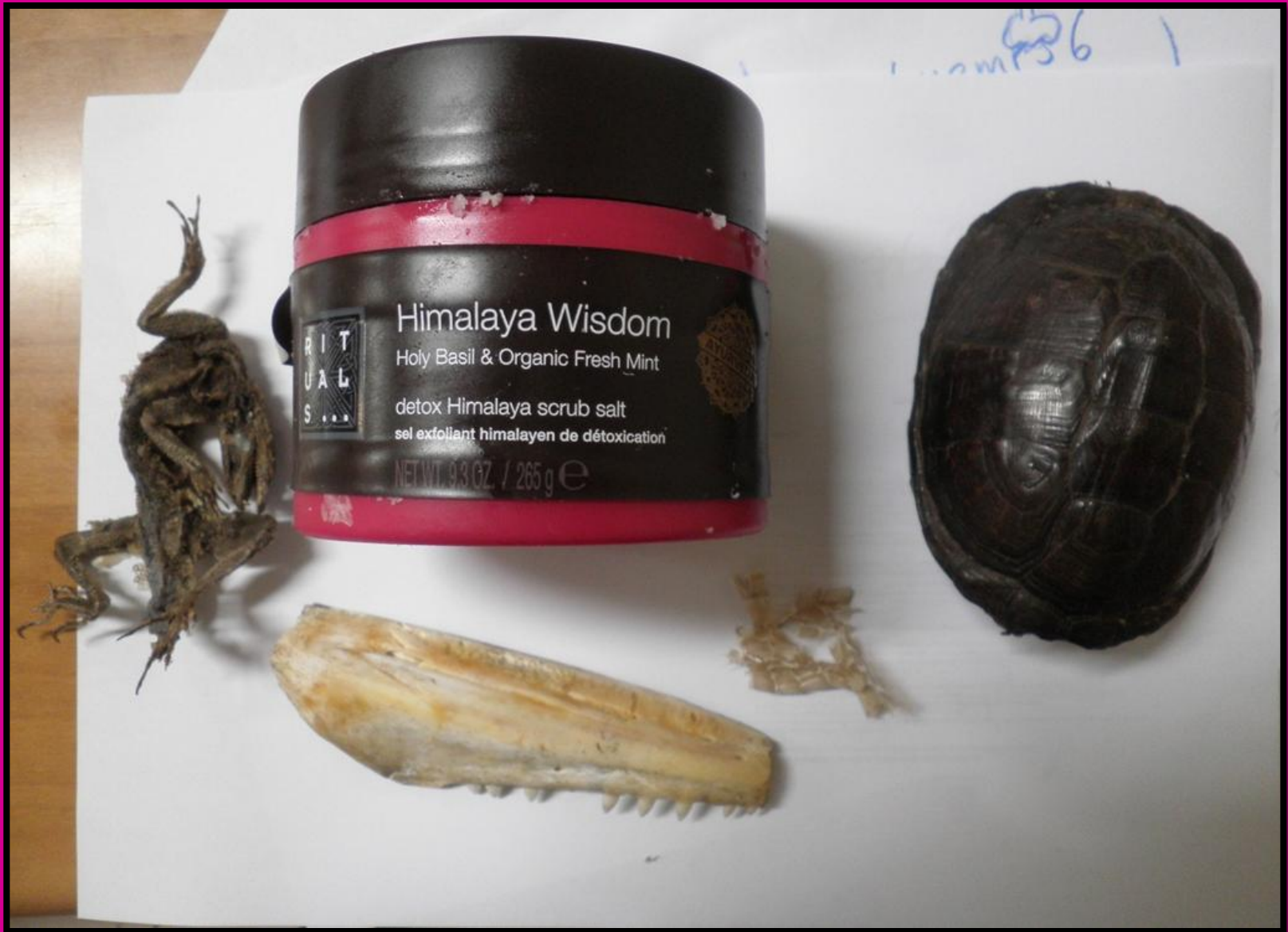
Some of the things on the Discovery Bench. Not all of them are smelly. All are interesting though.